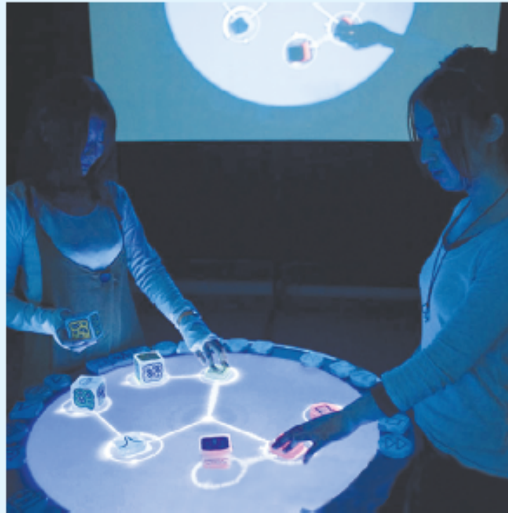
Figure 4.13 Two girls interacting with the Reactable Experience