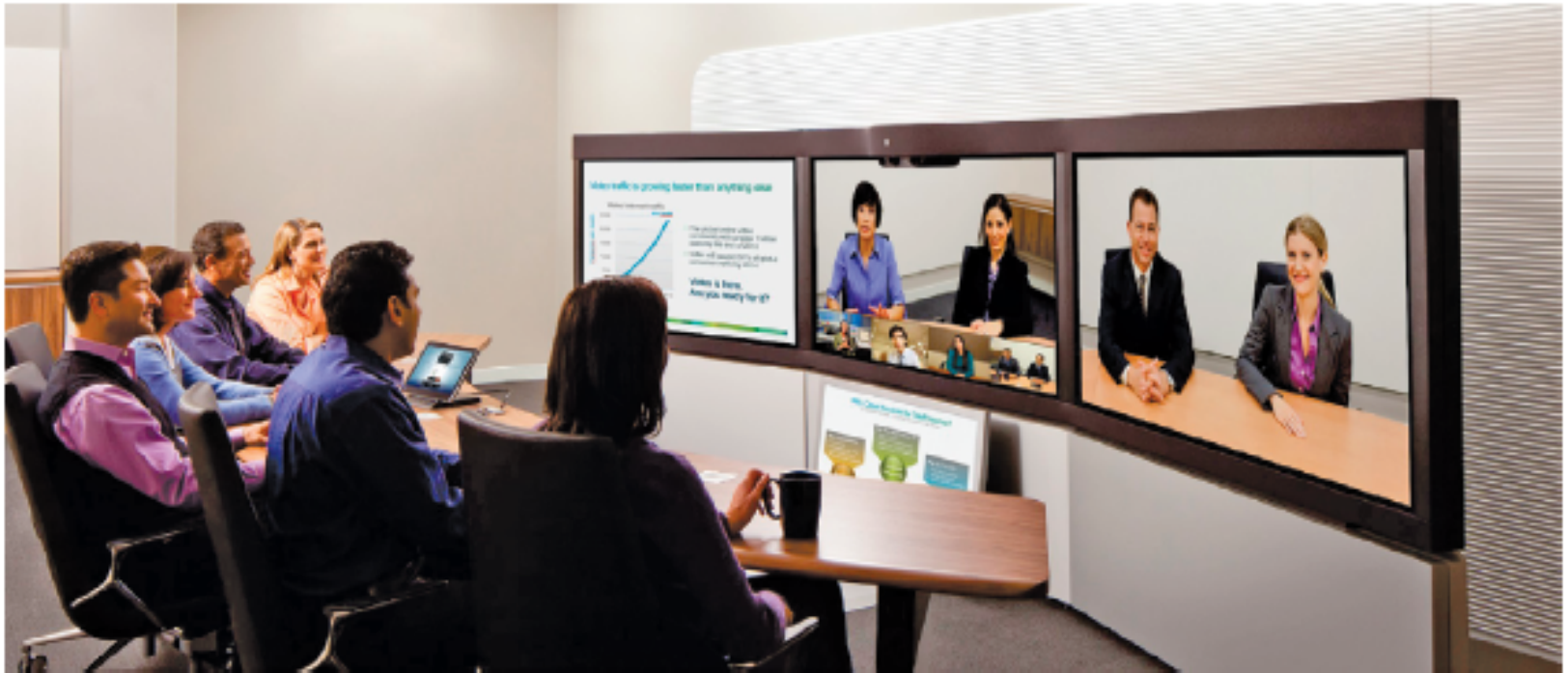
Figure 4.8 A telepresence room