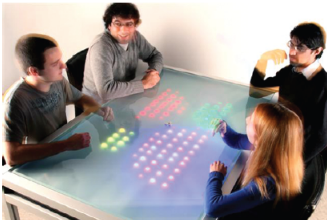
Figure 4.14 The Reflect Table