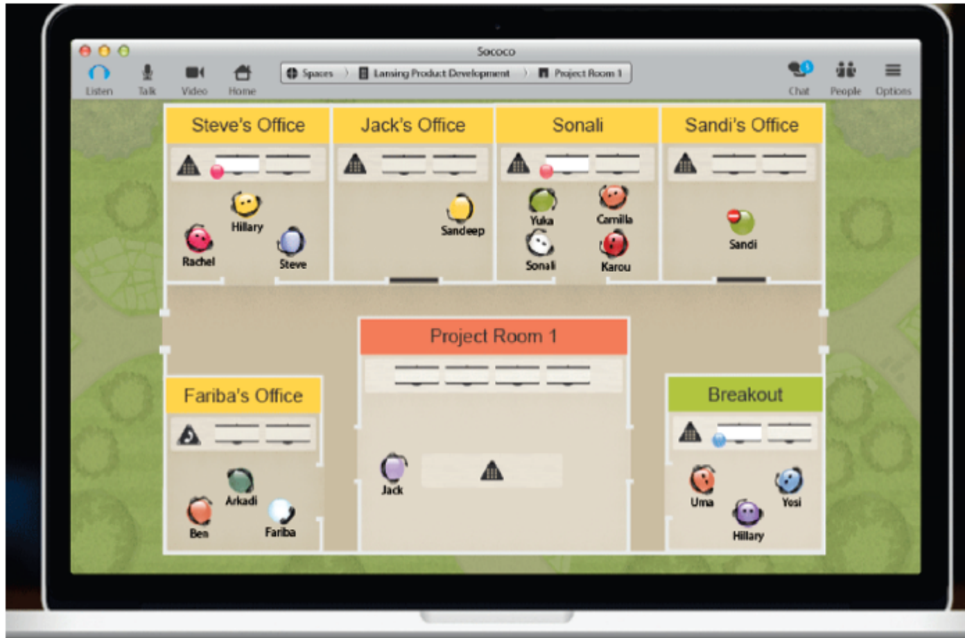
Figure 4.15 Sococo floor plan of a virtual office, showing who is where and who is meeting with whom https://www.sococo.com/